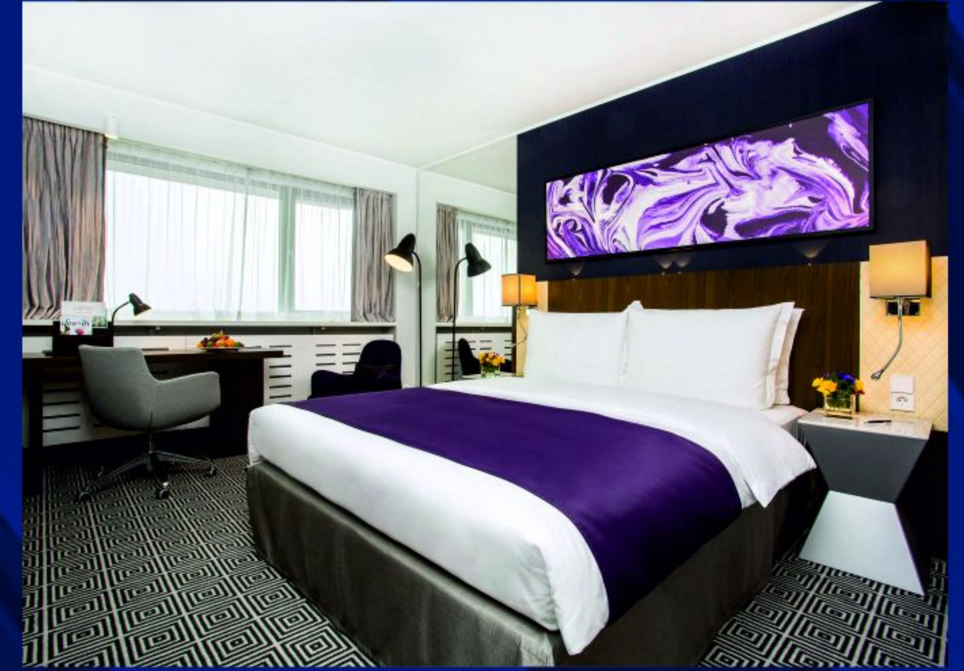
STANDARD CLASS ROOM