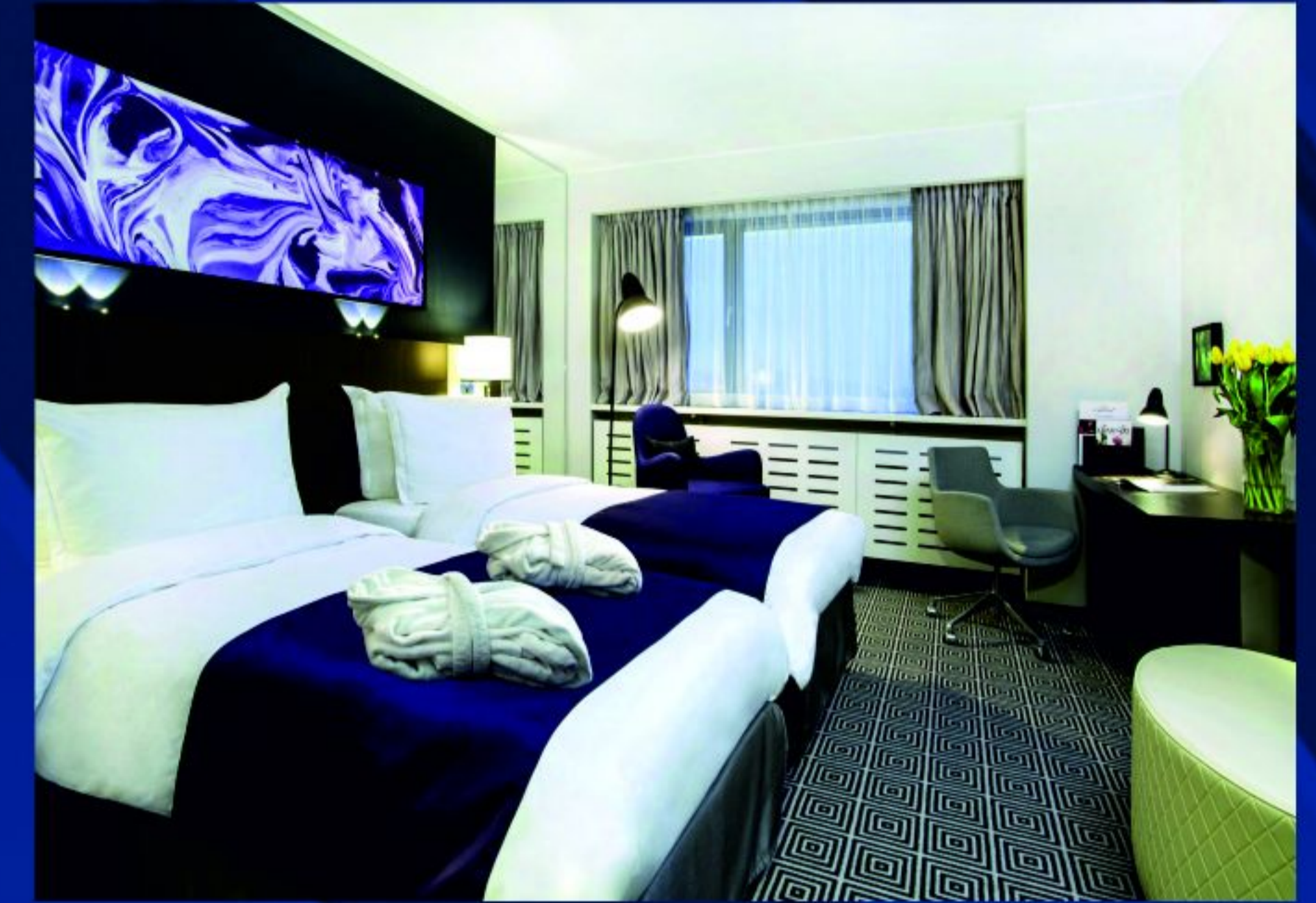
SUPERIOR CLASS ROOM