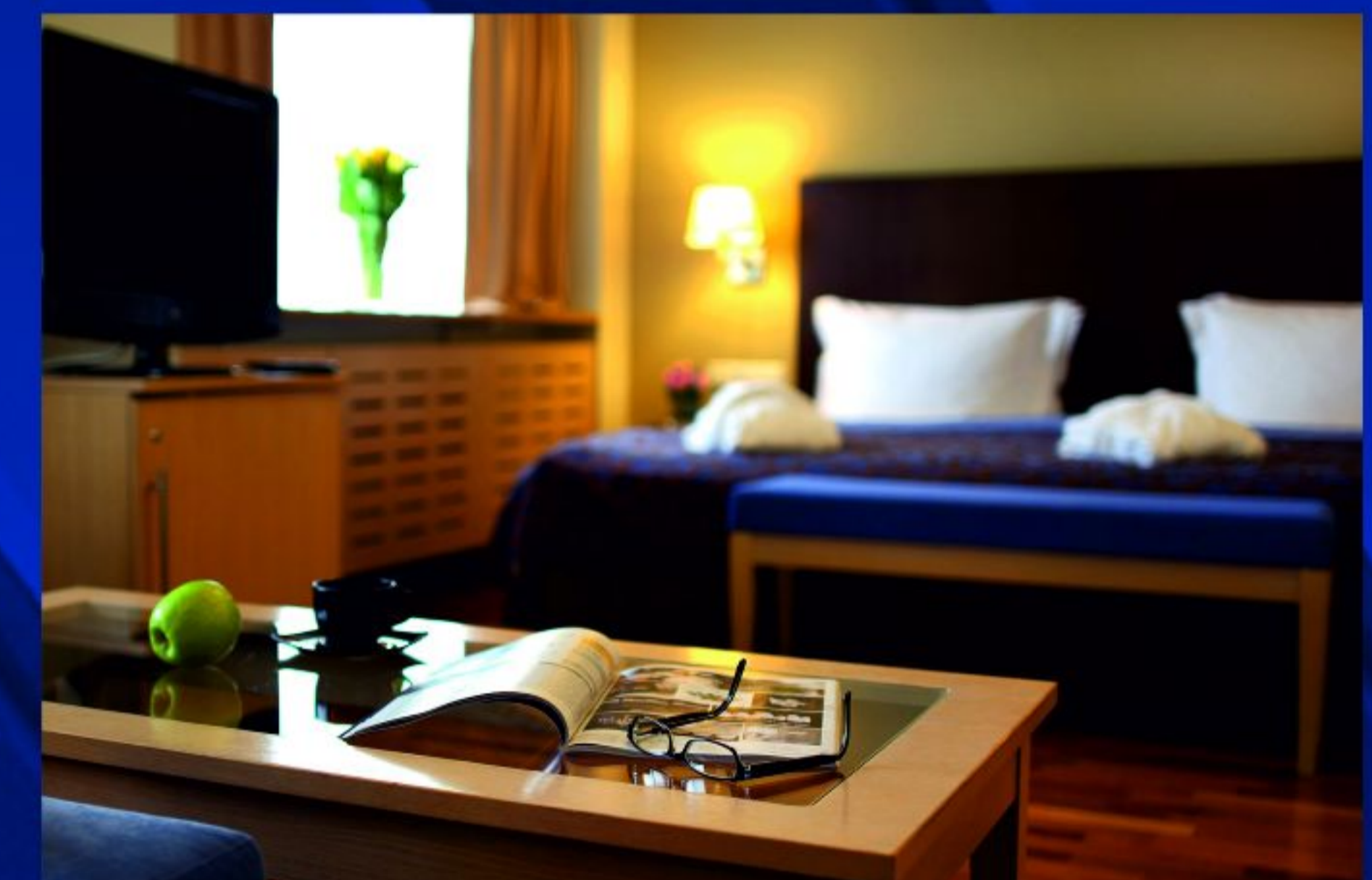
BUSINESS CLASS ROOM